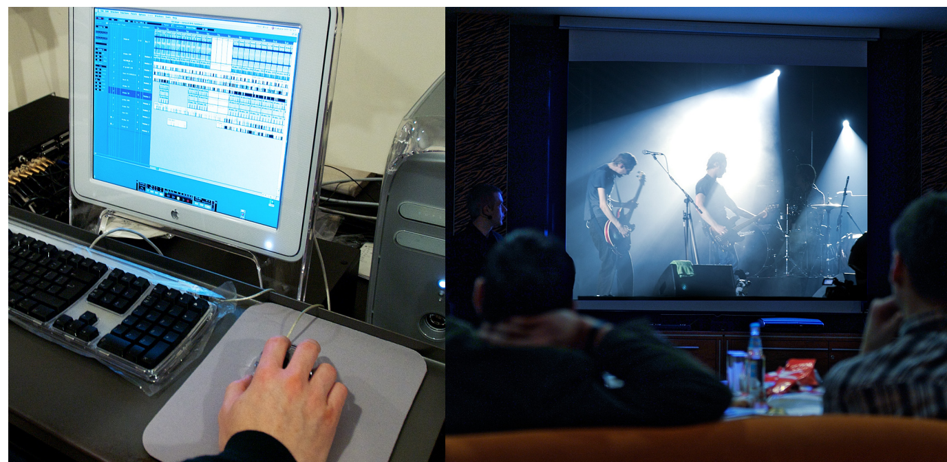
LessLoss power cables are effective with video applications as well. Color clarity and focus are improved.

“ First-rate all the way! The cables are sensational, and the price is a steal. Liudas and Vilmantas at LessLoss are perfectionists pursuing their love for the art of music reproduction.